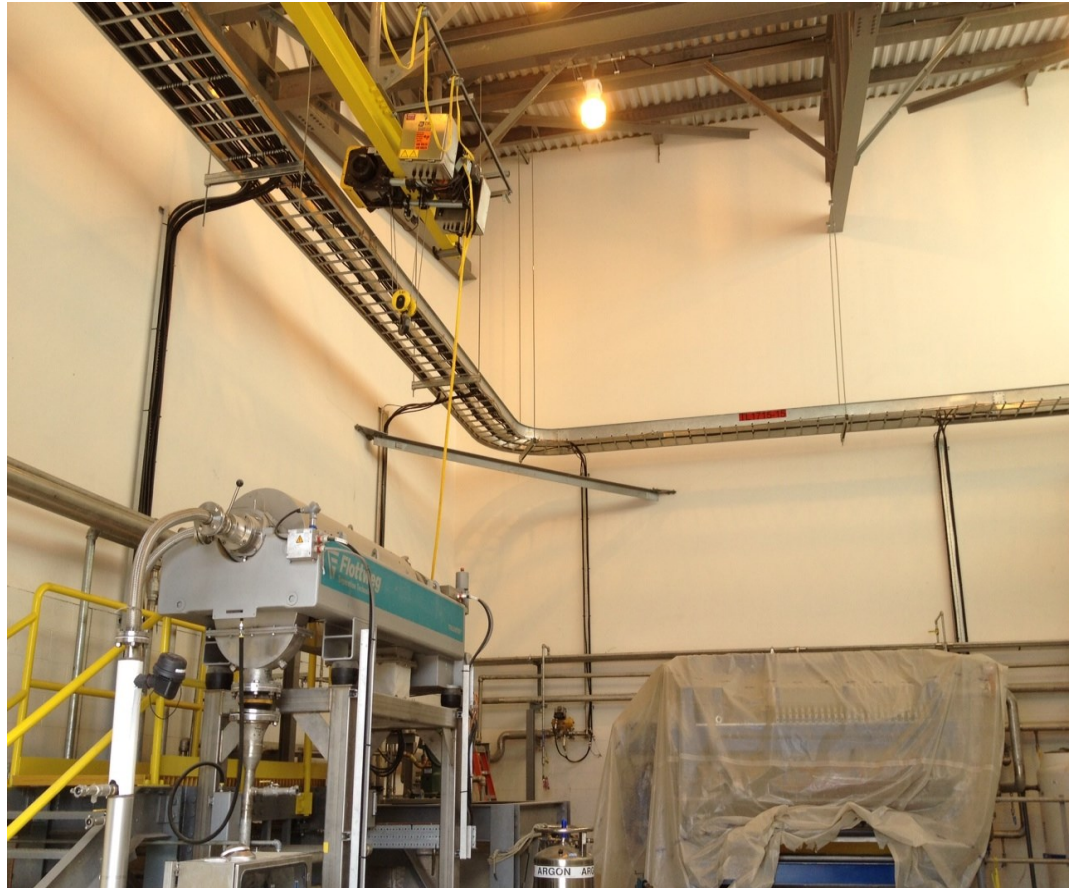
Phoenix Copper Leach Project—Newmont Mine Corp. Battle Mtn. NV